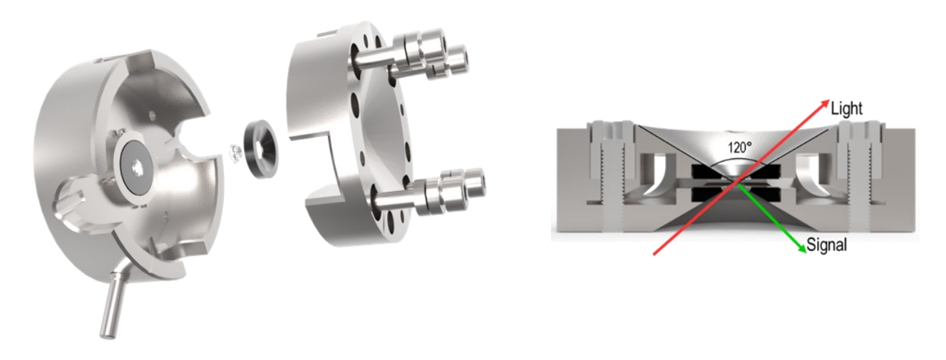
Figure 1. Expanded view of One20 DAC

The expanded view of the One20DAC is presented in Figure 1. The cell is equipped with two right-handed and two left-handed pressure driving screw, with a stack of spring washers for more uniform pressure drive control, mounting pin for placing the DAC onto the goniometer head, and resistive heating option is soon to become available. Preliminary tests with diamond anvils of 500 micron culet size resulted in the maximum pressure of 23 GPa, close to that of other diamond-anvil cell of piston-cylinder type.